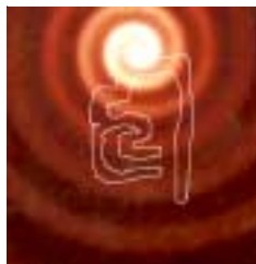
HEALING & MEDITATION WITH SWARA July 18th-20th September 5th-7th