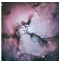
SHRUTI March 29th-30th August 2nd-3rd