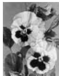
INTRODUCTION TO KARMAYOGA PERFECTION IN WORK May 25th September 14th