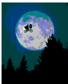
THE JOURNEY SELF-DEVELOPMENT & MASTERY August 30th-31st

Note: For each workshop extensive reading material was prepared and presented as booklets. These are available on order, from the Gnostic Centre.