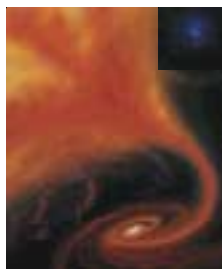
FEAR: ITS CAUSE & CURE May 4th August 9th (at Lady Shri Ram College)

Note: For each workshop extensive reading material was prepared and presented as booklets. These are available on order, from the Gnostic Centre.