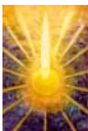
THE RISING SUN April 5th-6th